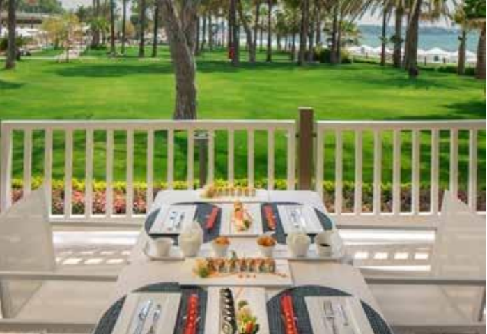
** The operation days and times of the units are determined by the hotel management according to seasonal conditions.