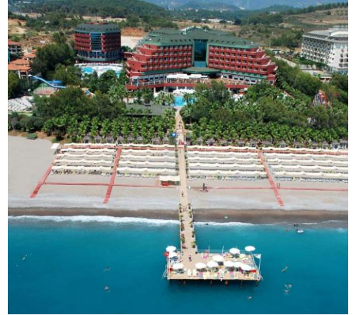
Main Building and Annex Building

Our hotel that offers you an excellent holiday option consists of a six-storey building (416 standard rooms) and a seven-storey annex building (79 family rooms and 3 standard rooms). In the main building there are 4 panoramic elevators and in the annex building are 3 elevators. In the lobby floor you find the reception, piano bar with live music, Delphin Cafe & Bar and stores for shopping.