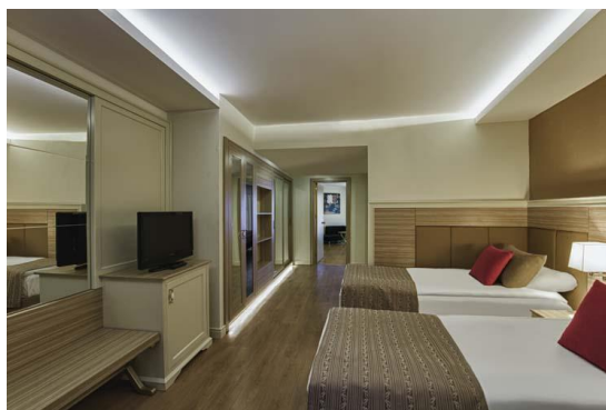
Family Room (Children)

Family Room: 43 m 2 . There are 1 parents room (1 french bed + 1 sofa), 1 children room (2 Single bed), LCD-TV, shower / WC, minibar, telephone, laminate flooring, balcony, safe, hair dryer Everyday: room cleaning, change of towels. Every 2 days: change of bed linen (Accommodation maximum: 3+2 oder 4+1) (Sofa Bed: 179 x 75 cm).