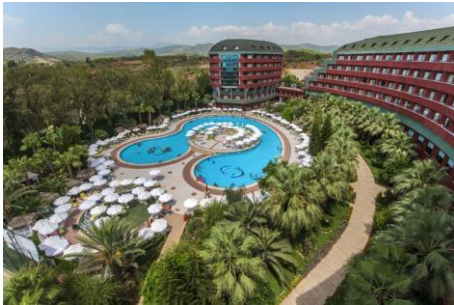
Pool 1 (Relax Pool)