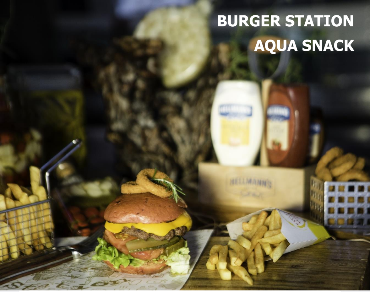
BURGER STATION AQUA SNACK