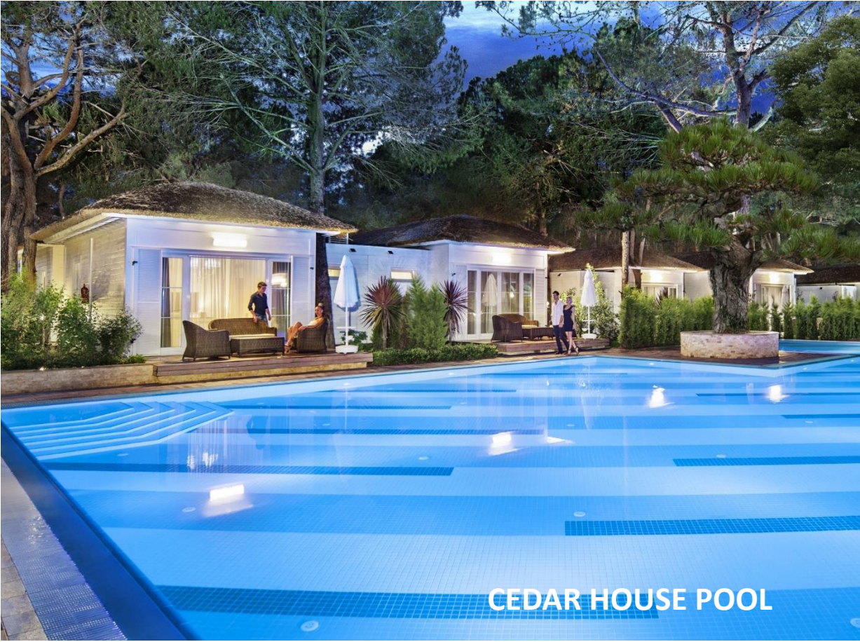
CEDAR HOUSE POOL