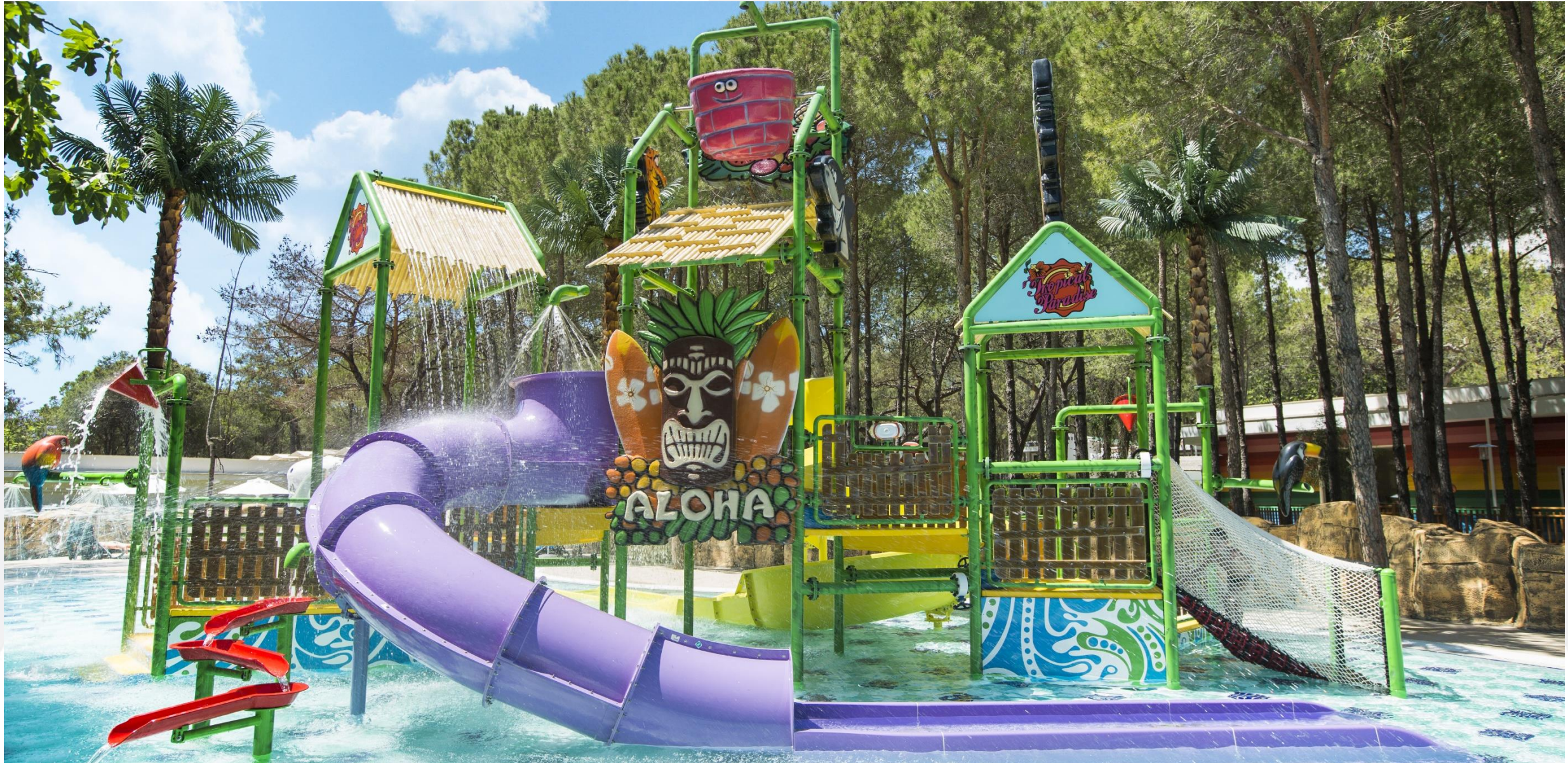
Thematic water slides for children.