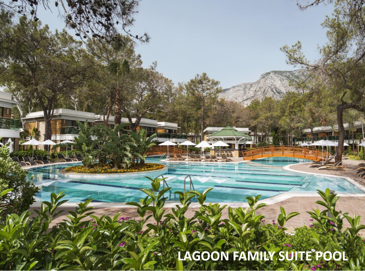
LAGOON FAMILY SUITE POOL

All pools are closed from 20:00 to 08:00 due to cleaning works and guest safety.