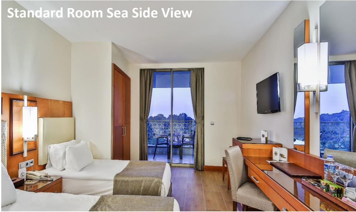
Standard Room Sea Side View