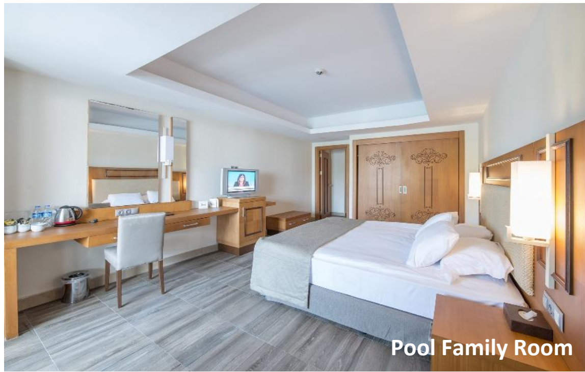
Pool Family Room