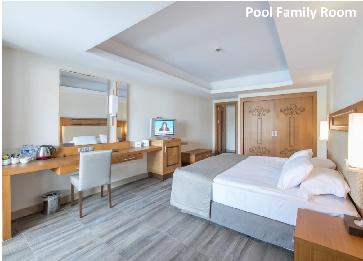
Pool Family Room